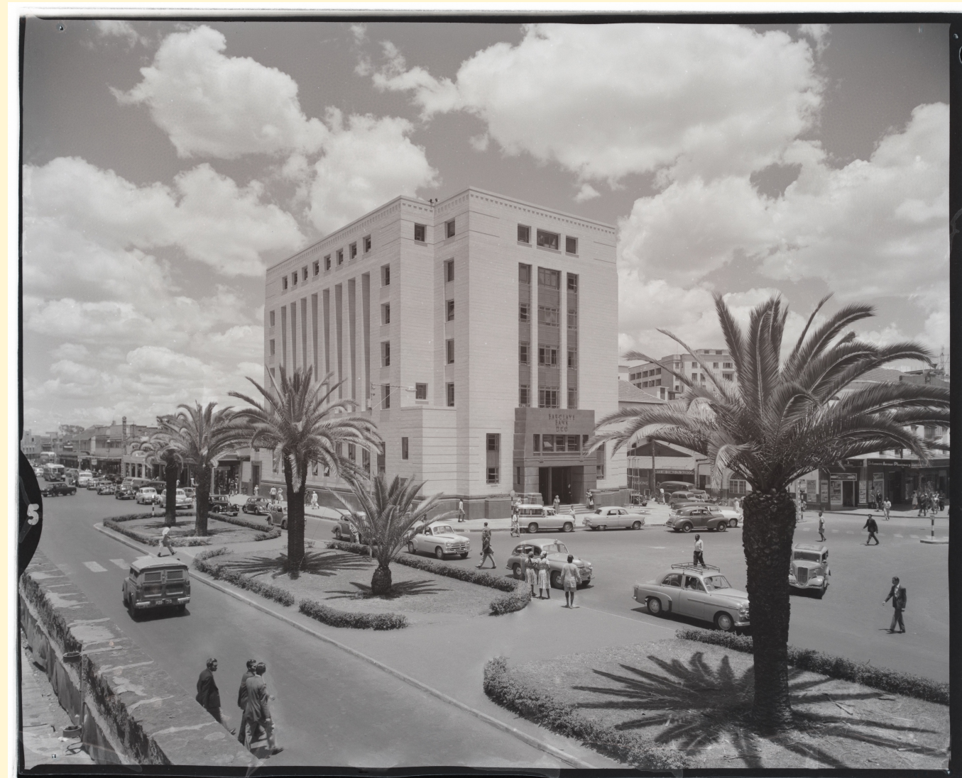
Bristol Archives, 2001/090/1/5/1/15 and 2001/090/1/1/8323