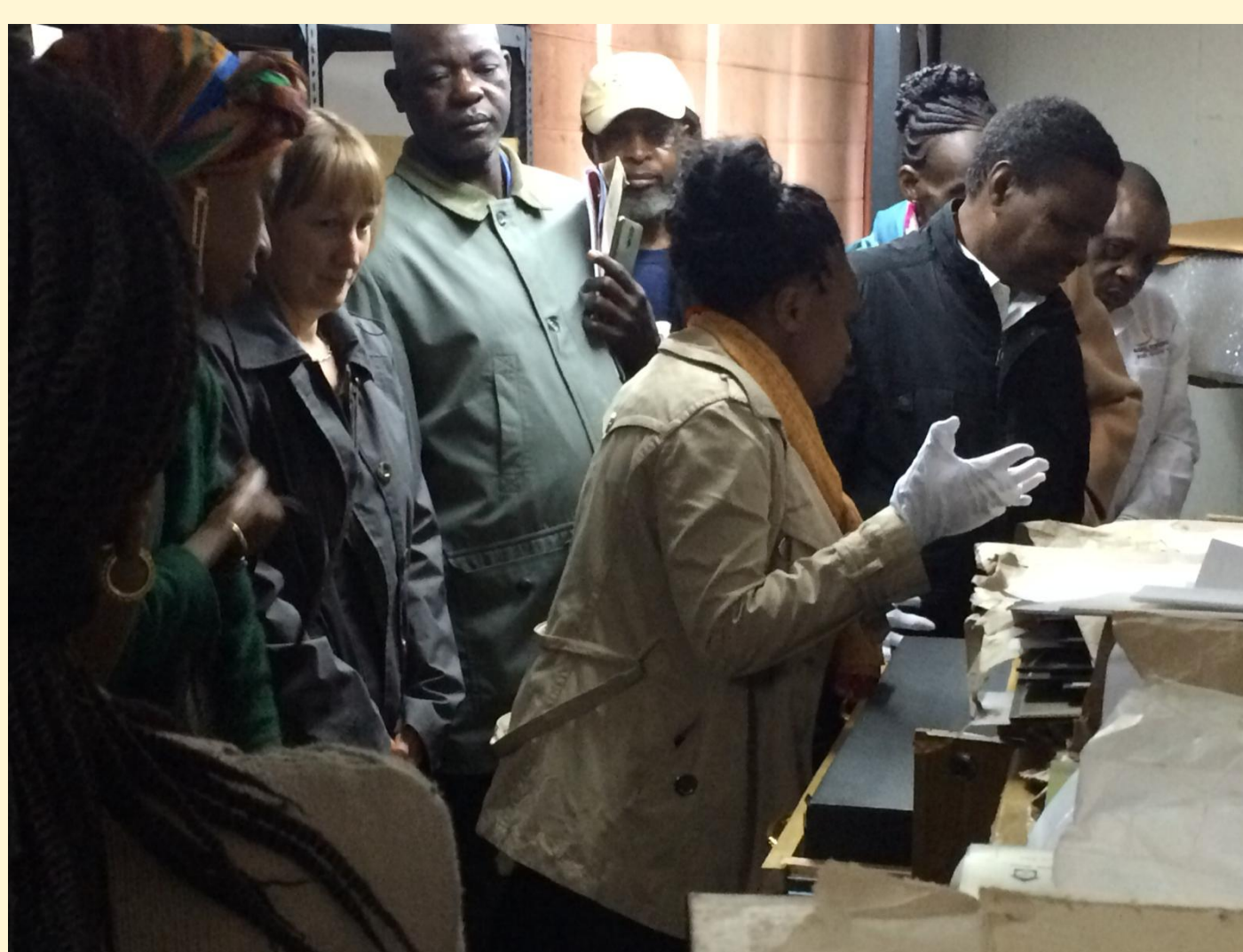
Workshop held in Nairobi, June 2019.